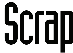
EXHIBIT HALL LUNCHEONS Booth 2225

CIRCLE OF SAFETY EXCELLENCE™ HOSPITALITY Booth 2036